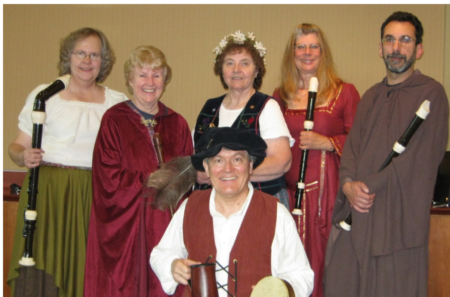
Sine Nomine playing at the Folsom Library on October 17.